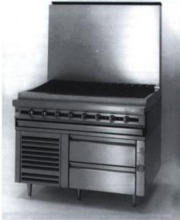
JMRH-48B Shown With High Back Riser And JRLH-02S-T-48