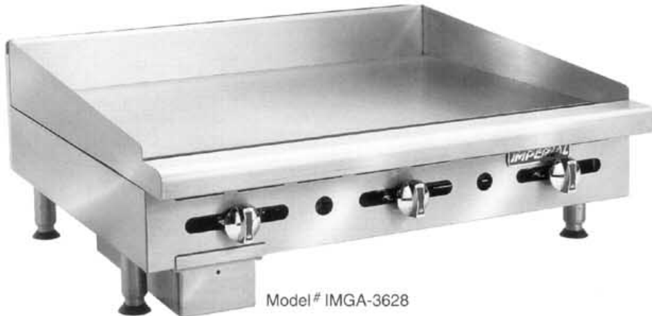
Model # IMGA-3628