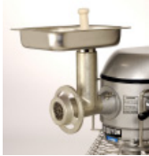
SM100HV (meat grinder)

Belt driven, 40 qts mixer with standard #12 attachment hub for slicer or grinder attachment.