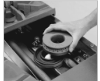
New standard Anti-Clogging burner head is shown. Anti-clogging pilot shield is designed into the top grate.