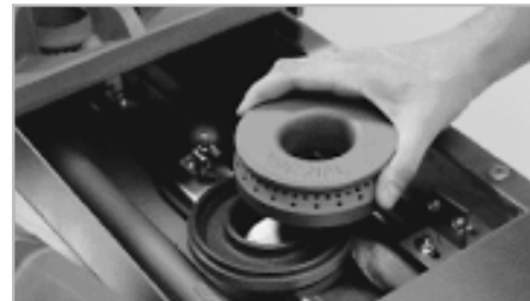
New standard Anti-Clogging burner head is shown. Anti-clogging pilot shield is designed into the top grate.