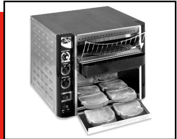
X*TREME-2™ RADIANT CONVEYOR TOASTER

See reverse side for product specifications.