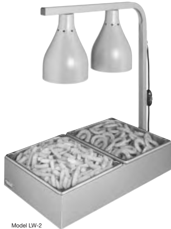
Model LW-2 with accessory food pans